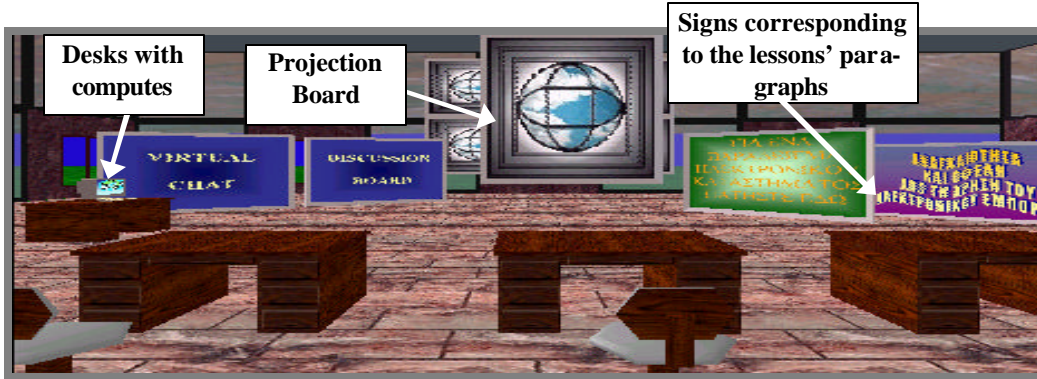
Picture 3: An aspect of the lecture room, where the basic objects are being viewed.

The Active Worlds environment offers the opportunity of using a Software Development Kit (SDK) [9]-[12], that allows the programmers to develop applications that can interact with the virtual world's environment. The most common type of application for the SDK is a bot. 3 Three (3) bots exist at the virtual world.